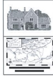
Image on front and new address on reverse with large location map.