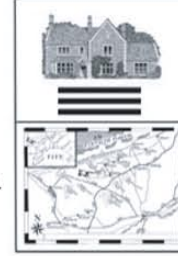
Image with new address on front and large map on reverse.