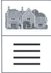
Image on front and new address on reverse.