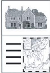
Image on front and new address on reverse with location map.