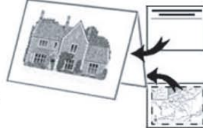
Image on front and new address inside and location map on rear.