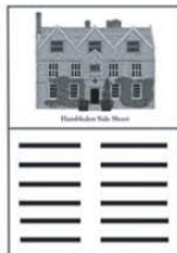
Image on front and card details on reverse.