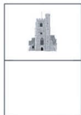
Image on one side and blank on the reverse.