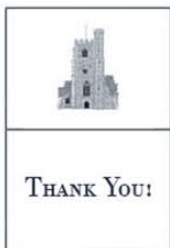
Image on one side and text on the reverse.